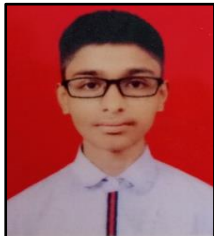
NAVNEET COMP. SCI-100