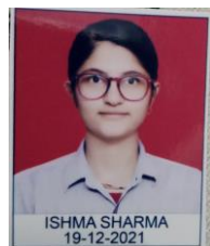
ISHIMA INFO. PRAC-95