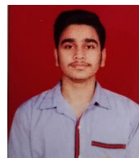
KARTIK HISTORY- 98