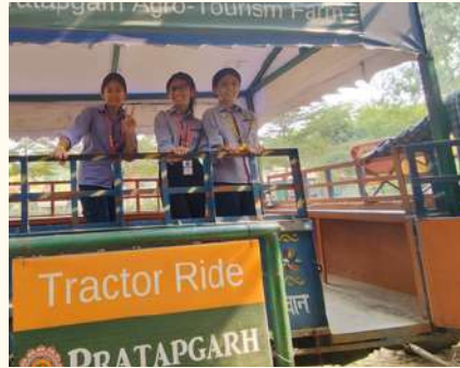
PICNIC TO EOD